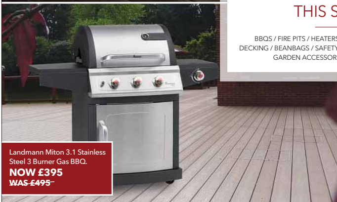
Landmann Miton 3.1 Stainless Steel 3 Burner Gas BBQ. NOW £395 WAS £495

BBQS / FIRE PITS / HEATERS / ALL WEATHER FURNITURE DECKING / BEANBAGS / SAFETY SURFACING / SPAS & SWIM SPAS GARDEN ACCESSORIES / PLAY EQUIPMENT