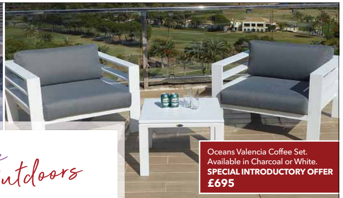
Oceans Valencia Coffee Set. Available in Charcoal or White. SPECIAL INTRODUCTORY OFFER £695