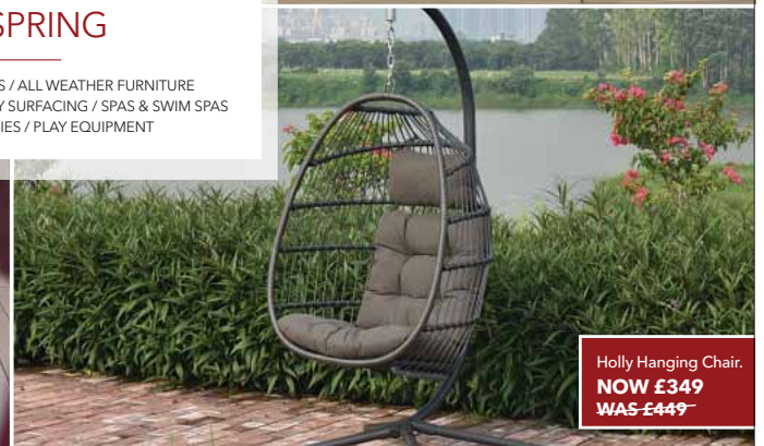
Holly Hanging Chair. NOW £349 WAS £449

With a range of products from the world's leading outdoor living suppliers you'll find everything to create your own unique outdoor space.